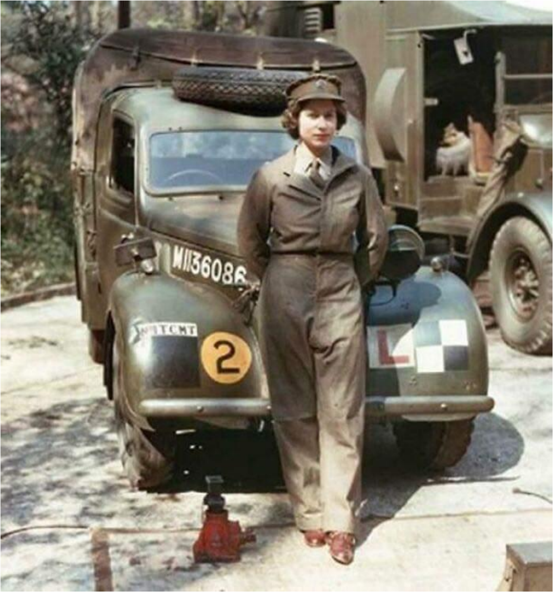
Here we can see a young Princess Elizabeth during the WW2.

scene of a major emergency with a well-ordered unit and intact command structure can be another motivation.