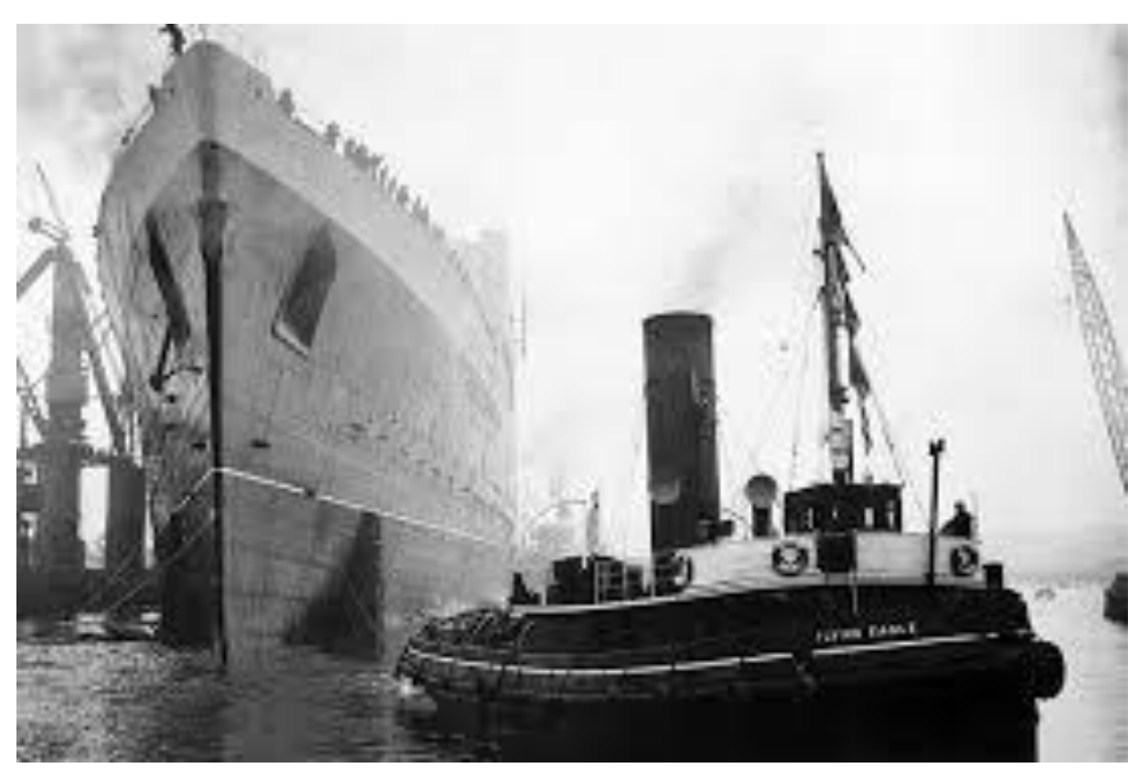
The launch day of the Queen Elizabeth at Clydebank shipyards.